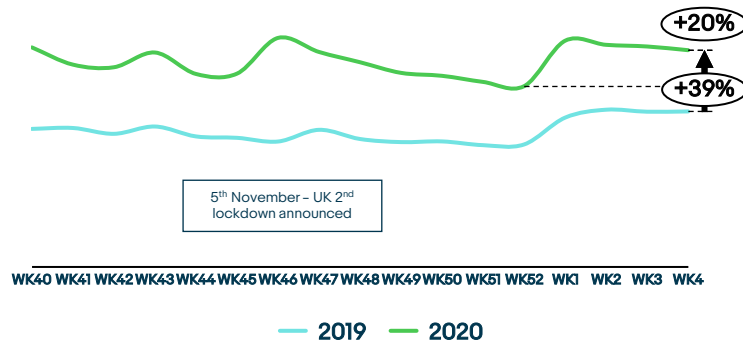
"Motorbikes for Sale", Search interest over time Google Trends, 7 Day Rolling Average, 23 rd May to 31 st January 2021